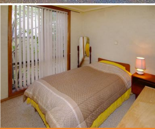
6 WANDONG AVENUE WANDONG, VIC