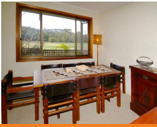
6 Wandong Avenue Wandong WALLAN, VIC