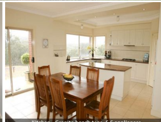
Kitchen - Granite bench top, S.S. appliances