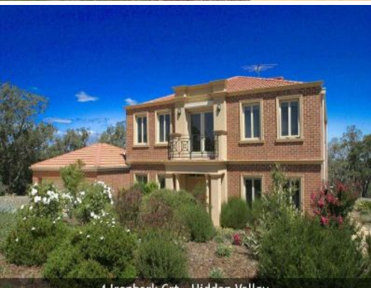
4 Ironbark Ct., Hidden Valley