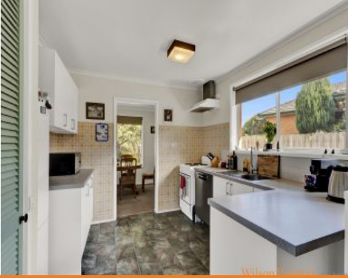
12 Fitzroy Street Kilmore, VIC